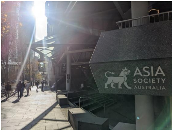
Figure 2. Asia Society Australia sign

Walk North about 100 metres until you reach a sign that reads “Asia Society Australia” and go up the stairs. On a sunny day, the light can be quite harsh , especially as there is glare from the bluestones that make the sidewalk.