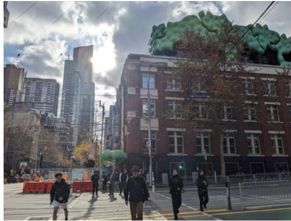
Figure 1. RMIT Design Hub

We start at the RMIT Design Hub in the North-East corner of the intersection of Swanston and La Trobe Street. The building has distinct green decorations that look like clouds. The intersection may be busy and there may be construction work. Watch out for construction signs, obstacles, narrow paths, cyclists, and uneven surfaces