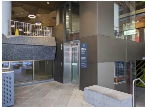
Figure 5. Lift to access Building 8 from Swanston Street

The landing on level 4 is a bit narrow and exposed . Go through the automatic door and you will find a corridor with brightly coloured furniture and bright downlights .