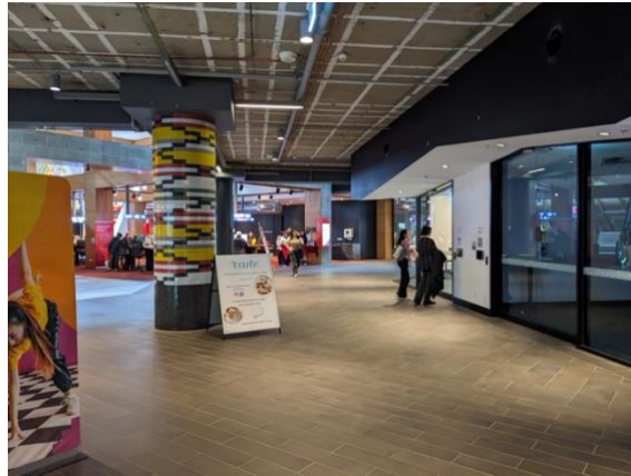
Figure 8. Make a slight left

Follow our guide on lift access to the Library from Bowen Street