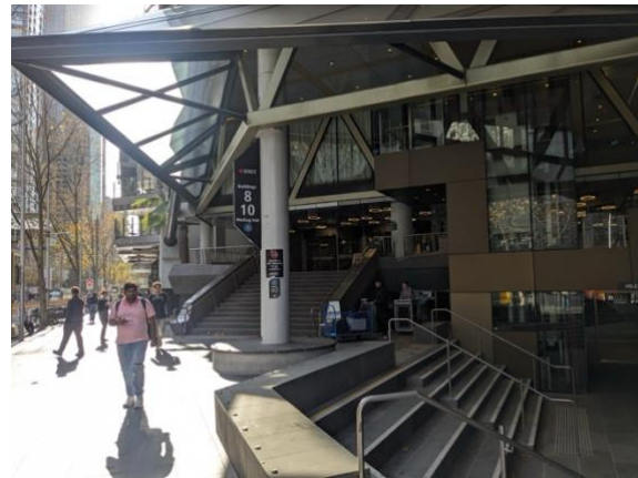
Figure 3. Building 8, 10 sign