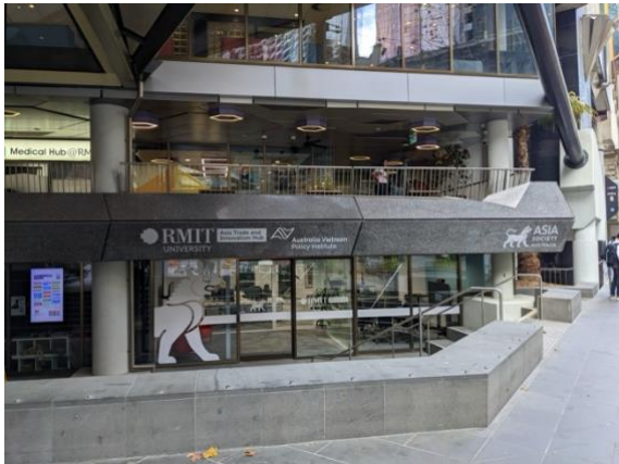
Figure 4. Space between the stairs in Building 8