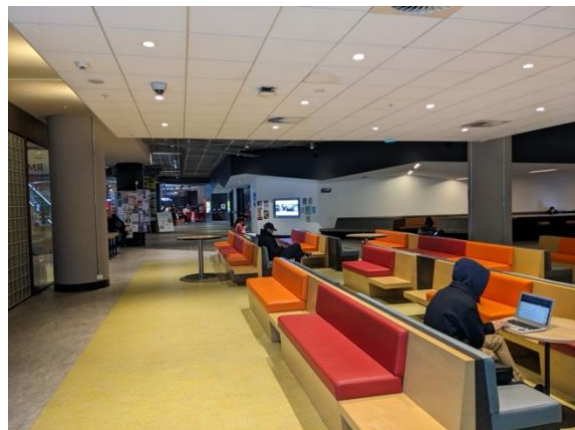
Figure 7. Building 8 Level 4 corridor

Go toward the end of this corridor, pass the round pillar covered in flayers and make a slight left toward the corridor with the yellow neon signs.